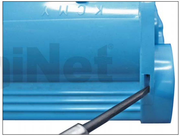
REPLACING THE OEM CHIP 8. Using a small flat head screwdriver, unlock the chip by pressing on the release tab in the slot shown.

NOTE : You will need to mix toner and carrier in the same toner bottle before refilling the toner hopper.