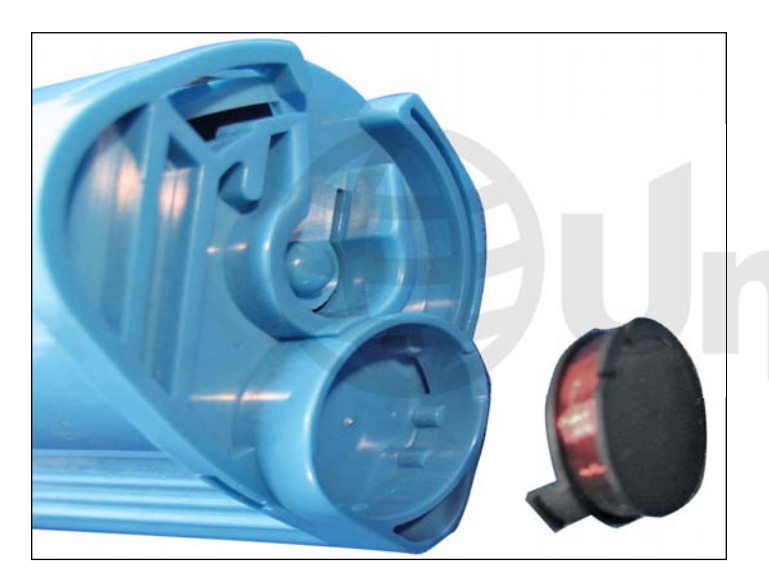
9. Make sure the replacement chip tabs enter the slots during insertion so that they lock in place.