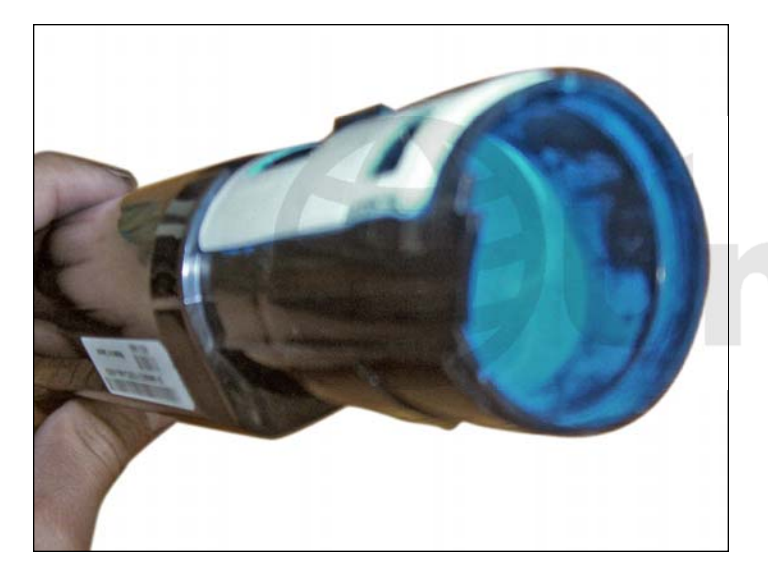
7. Shown is the waste carrier chamber. Empty it out and you will find the toner fill plug inside. Remove the plug and clean out the cartridge for refilling.

6. Remove the carrier fill plug as shown.