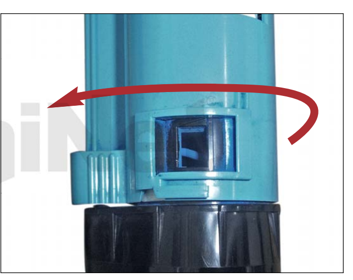
4. Turn the cap until the tab comes to a complete stop and has entered under the blue cap.