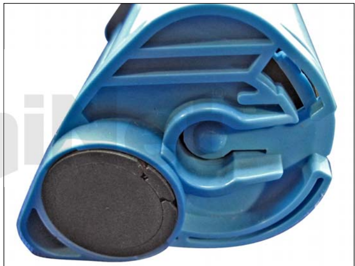
10. Replacement chip installed.