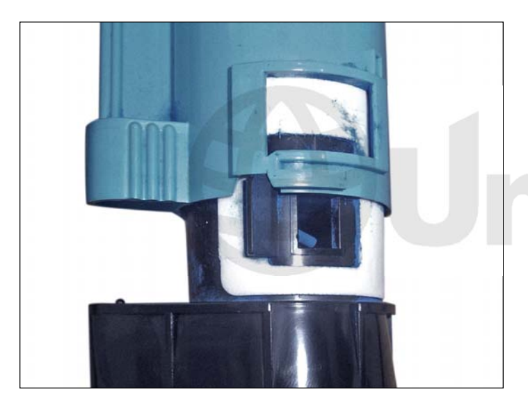
5. Now slide the cap out away from the cartridge.