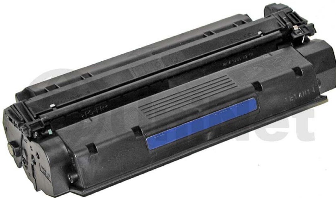
HP 1200 TONER CARTRIDGE