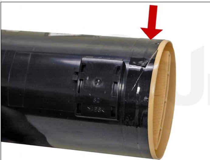
1. Remove the tape from the colored end cap.

The Xerox Phaser 7700 toner cartridges are rated for 5,000 / 12,000 pages black and 4,000 / 10,000 pages color. The OEM part numbers are 016-1882-00 Black (5K), 016-1947-00 Black (12K), 016-1879-00 Cyan (4K), 016-1944-00 Cyan (10K), 016-1880-00 Magenta (4K), 016-1945-00 Magenta (10K), 016-1881-00 Yellow (4K), and 016-1946-00 Yellow (10K). Use two bottles for the HY cartridges. There are no chips used in this cartridge.