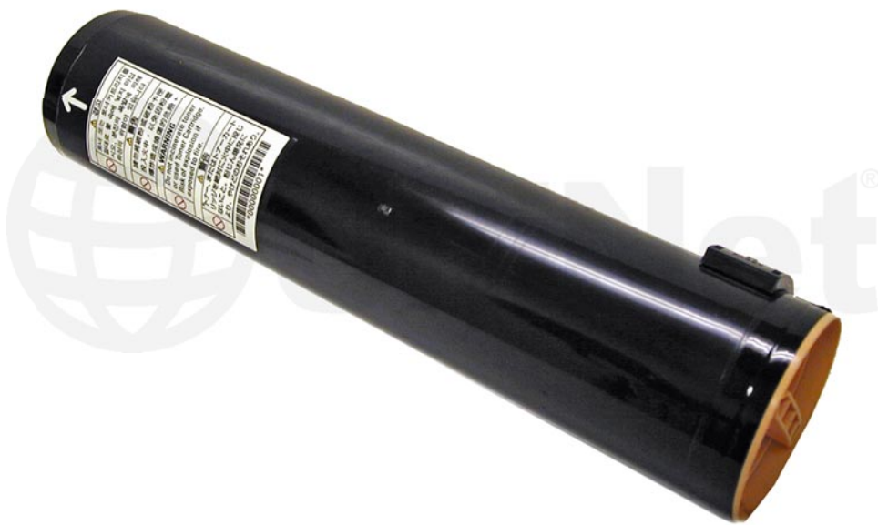
XEROX PHASER 7700 SERIES TONER CARTRIDGE