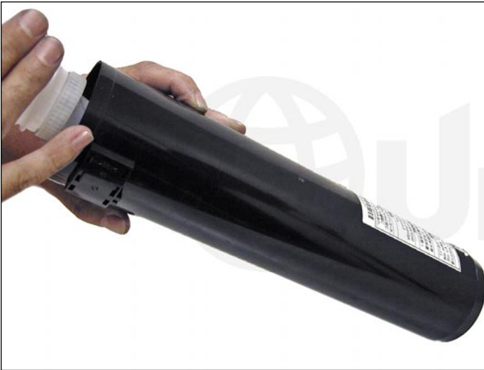
3. Vacuum the tube clean, and fill with new toner.