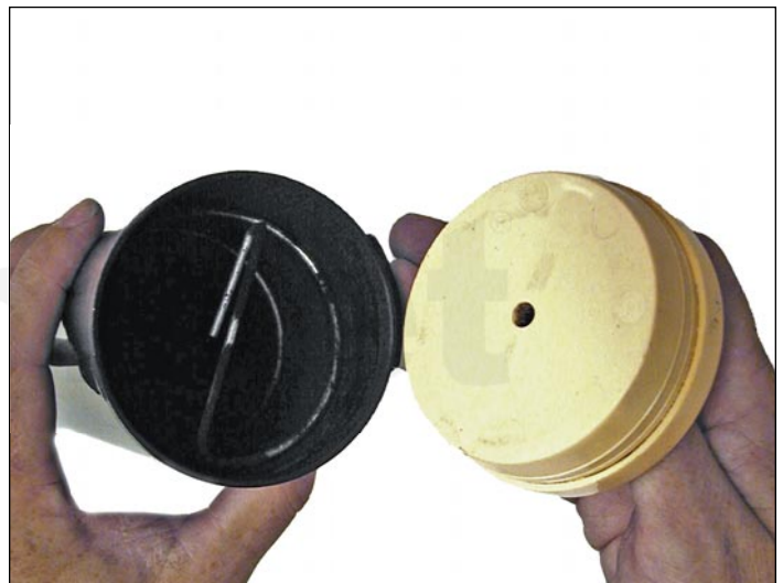
2. Remove the end cap.